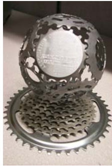
The impressive (and heavy) award is comprised of reclaimed materials

The Association of Oregon Recyclers awarded the Department of Justice won the Leadership in Sustainability award at their dinner reception on June 18 in Salem. Congratulations, DOJ!